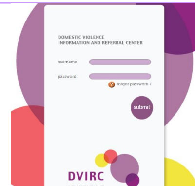
DVIRC Log-in Screen